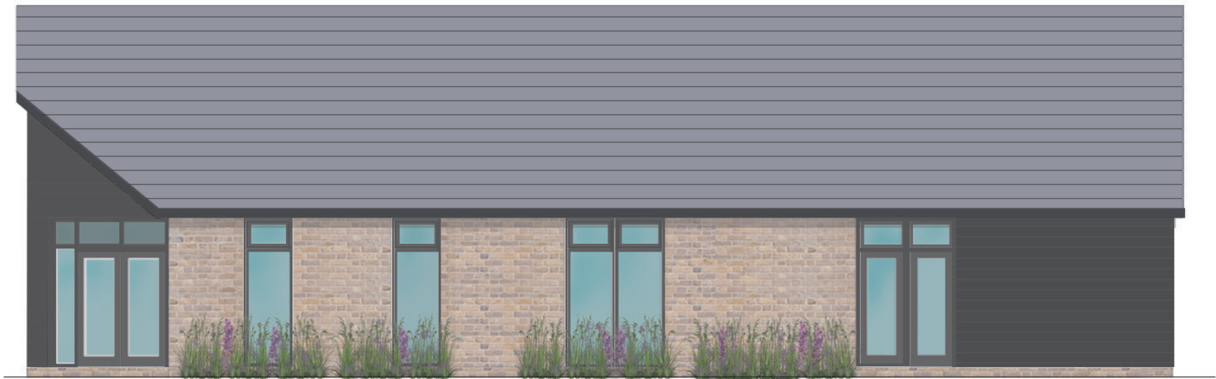
ELEVATION TO CAR PARK