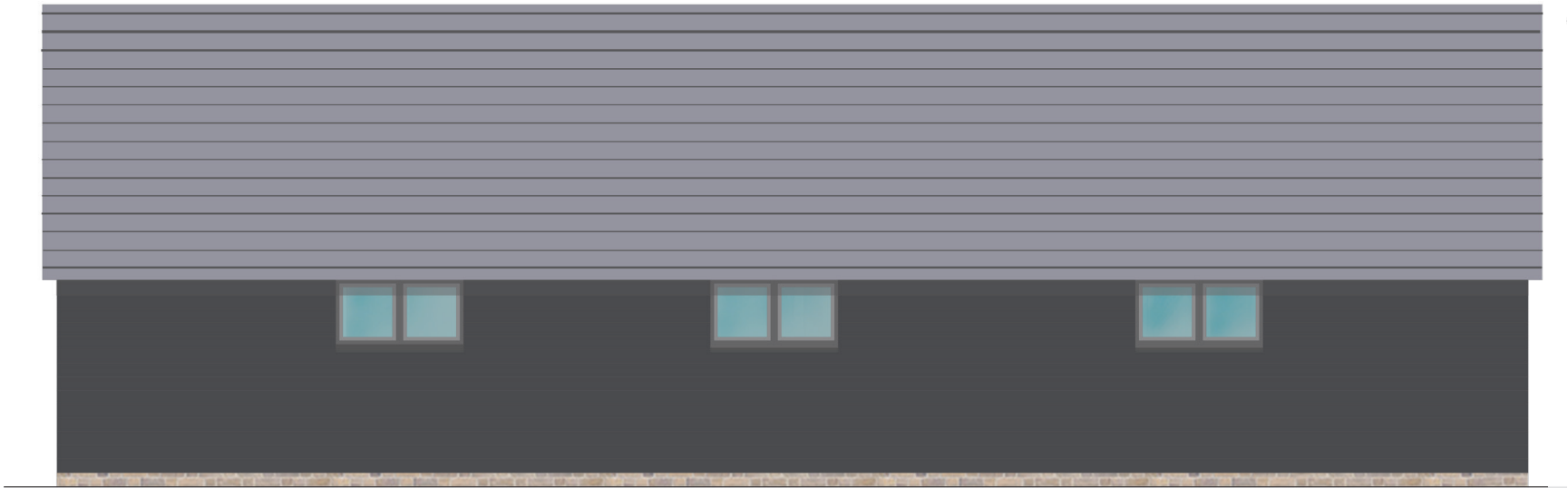
ELEVATION TO SCHOOL LANE